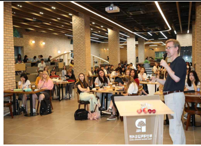
Special Lecture ('24.)