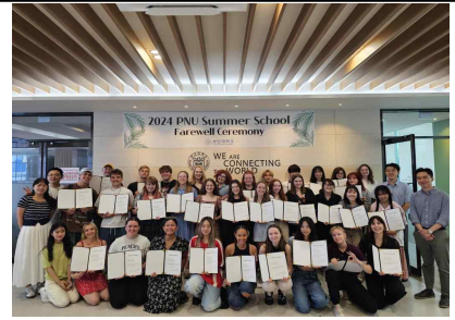
Farewell Ceremony ('24.)