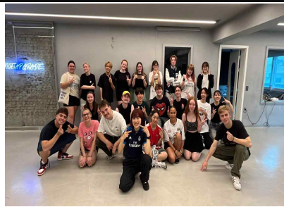
K-pop Dance ('24.)