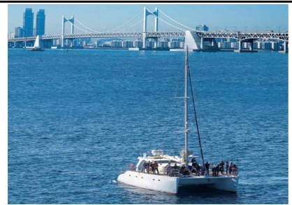
Haeundae Yacht Tour