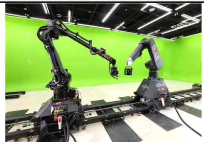
Busan Cinema Studios