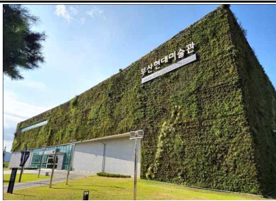
Busan Museum of Contemporary Art