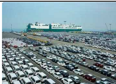
Hyundai Motor Ulsan Plant