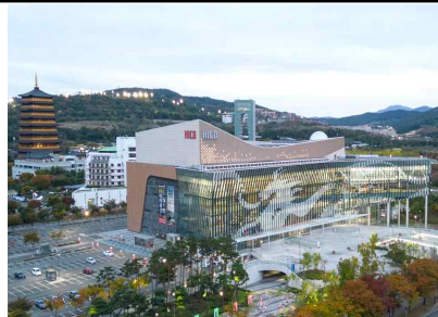
2025 APEC (HICO)