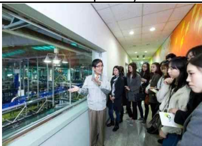
Daesun Brewery Factory