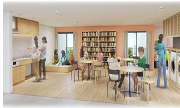
[Public space] (2F–10F) Residents chatting with each other