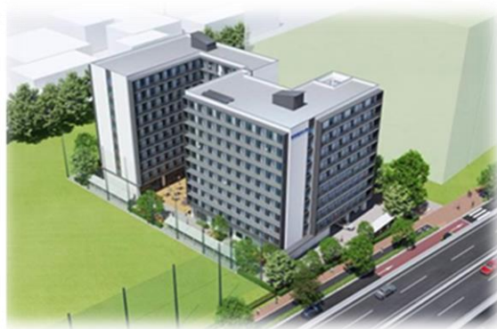
[Rendering] Aerial view of the new dormitory

The new dormitory will serve as a residential facility fostering a diverse community where Japanese students, international students, and international researchers live together.