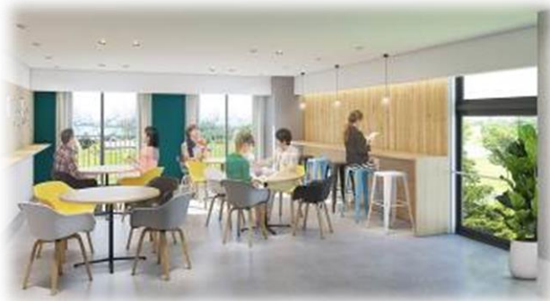
[View lounge] (2F–10F) View lounge with southern views