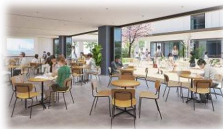
[Global Public Lounge] (1F) Open space with an integrated view of the courtyard

Group companies: GKK Architects & Engineers, Daiwa LifeNext Co., Ltd., Fuyo General Lease Co., Ltd.