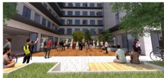
[Community plaza] Open space with good sight

The above rendering reflects the building operator's proposal; the design and other features may be altered to reflect future changes in the building plan.